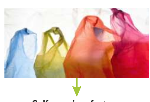
Self carrying feature