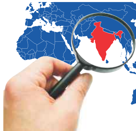
Visitors from across the globe Trading Partners